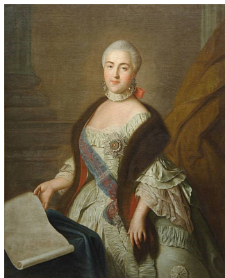
Catherine II, the Great Empress of Russia

AHSGR Oregon Chapter P.O. Box 55218 Portland, OR 97238-5218