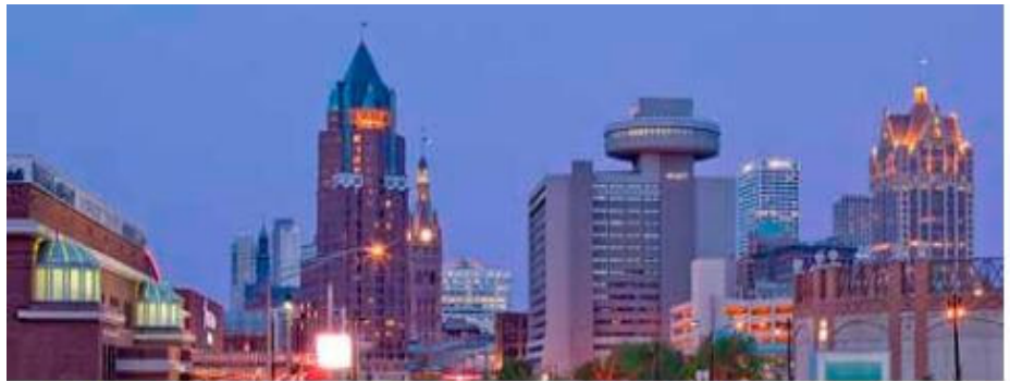
The Hyatt Regency Milwaukee, a distinctive feature of the downtown Milwaukee skyline with its circular rooftop ballroom, is the site of the 2017 AHSGR convention, Aug. 28-31.

The Hyatt Regency is conveniently located in downtown Milwaukee, within walking distance of many local attractions, including nationally famous German restaurants and a German sausage store.