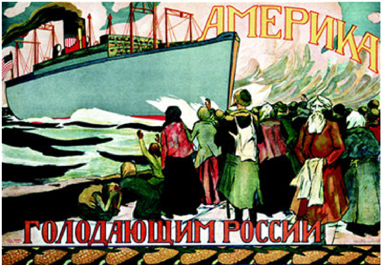
American Relief Administration Poster Requesting Help for the Russian Famine