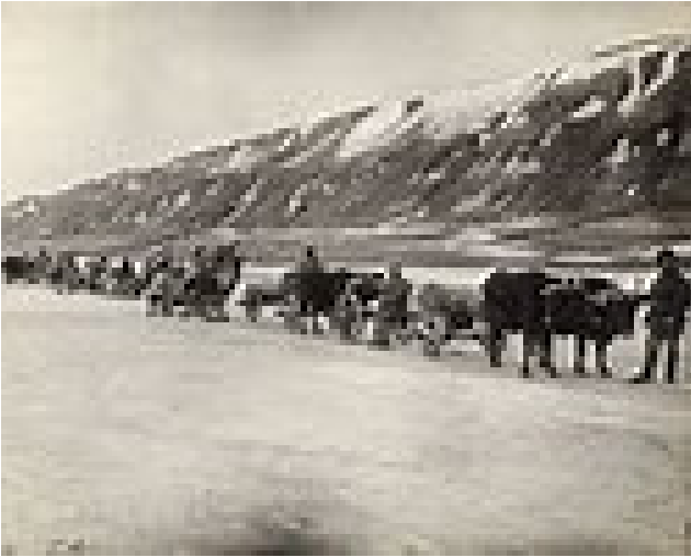
An ARA supply caravan on the frozen Volga River in the winter of 1922.