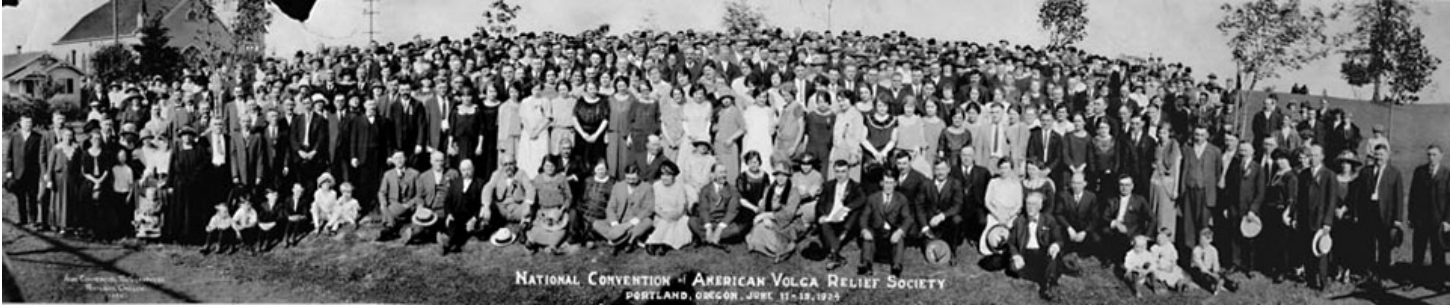
National Convention of the American Volga Relief Society in Portland, Oregon, June 1924.

Following the 1917 Bolshevik Revolution in Russia the Volga colonists were forced to give up their seed wheat. Then in the fall of 1920 and 1921, total crop failures occurred along the Volga, and one of the greatest famines in years set in. Approximately 170,000 men, women, and children died of starvation in the Volga German colonies alone.