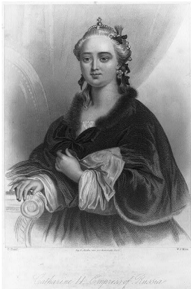
Catherine II, the Great Empress of Russia

AHSGR Oregon Chapter P.O. Box 55218 Portland, OR 97238-5218