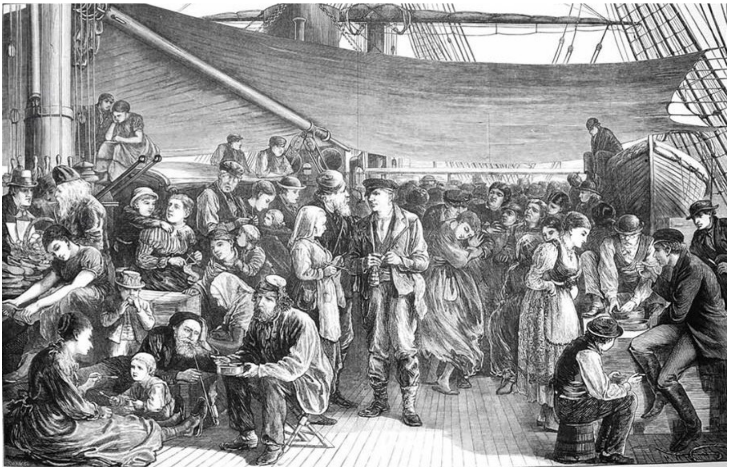
THE STEERAGE OF A NORTH GERMAN LLOYD'S ATLANTIC STEAMSHIP.