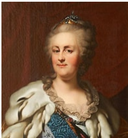
Catherine II, the Great