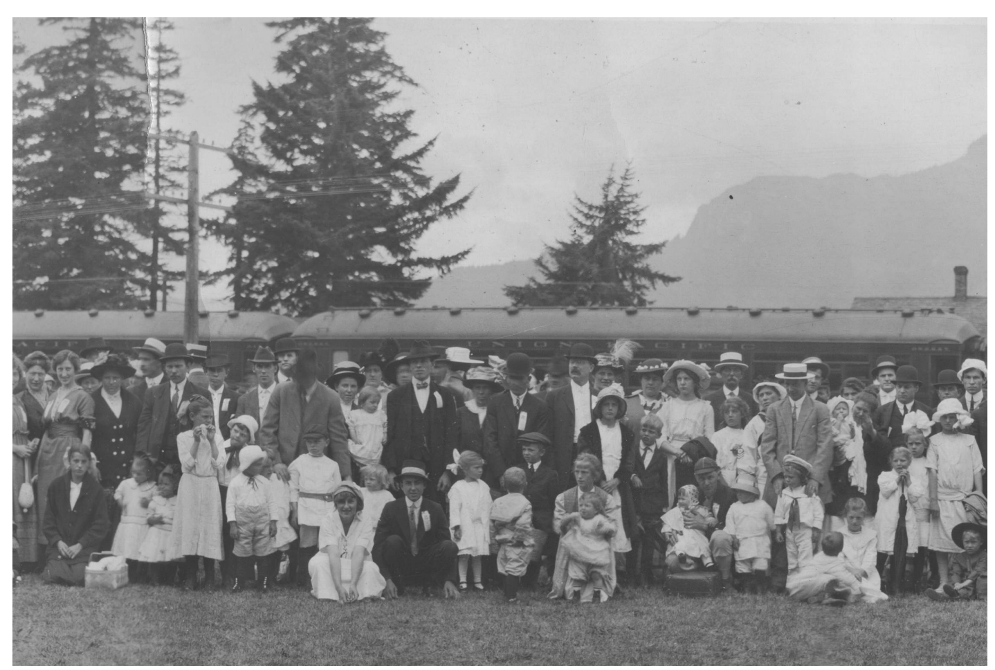
1st annual picnic of employees of the Oregon-Washington Railroad & Navigation Co. at Bonneville, July 17, 1915 - part 1 of 5 of a panoramic print

This issue can be viewed online at: http://www.ahsgroregon.com